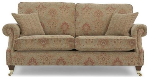
2 Seater Sofa - £998, after sale price £1,098