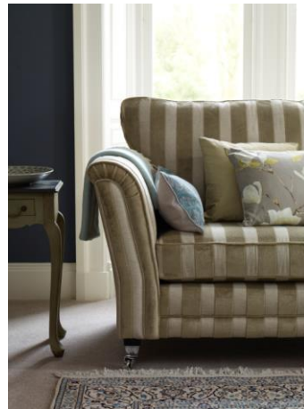
4 Seater Sofa - £1,399, after sale price £1,499