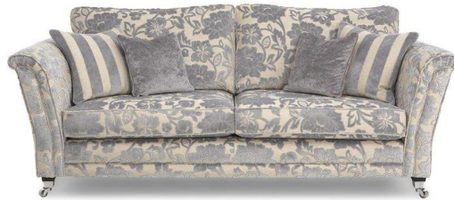
Striped 2 Seater Sofa - £1,299, after sale price £1,349